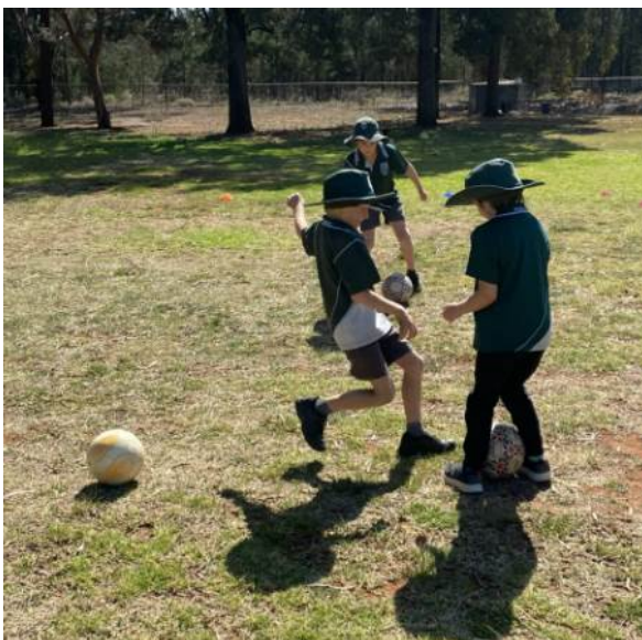
Max ready to attack!