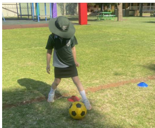
Brooklyn dribbling in control.