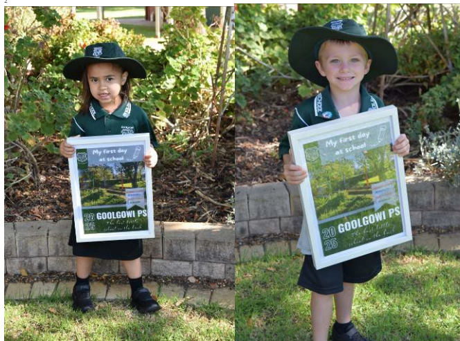
Kindergarten First Day